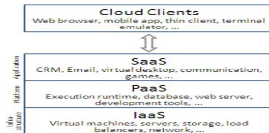
Fig 1: Cloud Services

The Fig 1 shows the working of cloud services with the cloud clients using appropriate protocols for interaction between the SaaS, PaaS, IaaS.